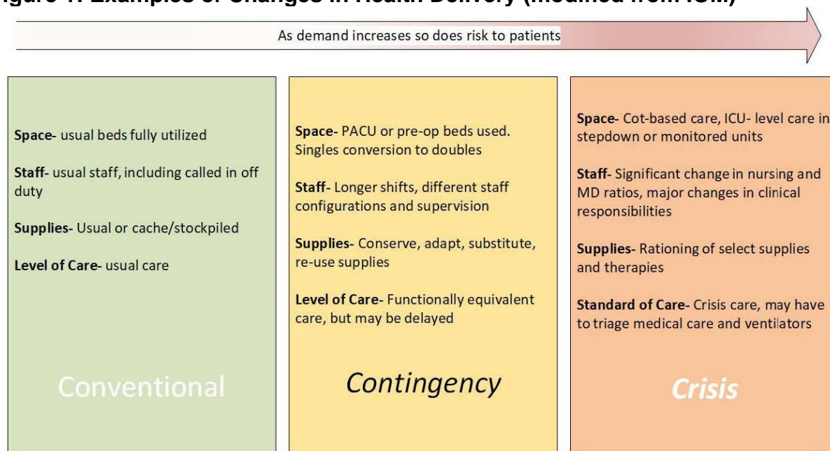
Figure 1: Examples of Changes in Health Delivery (modified from IOM)