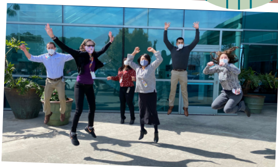
Registered dietitians help ensure that patients eat the most healing food.